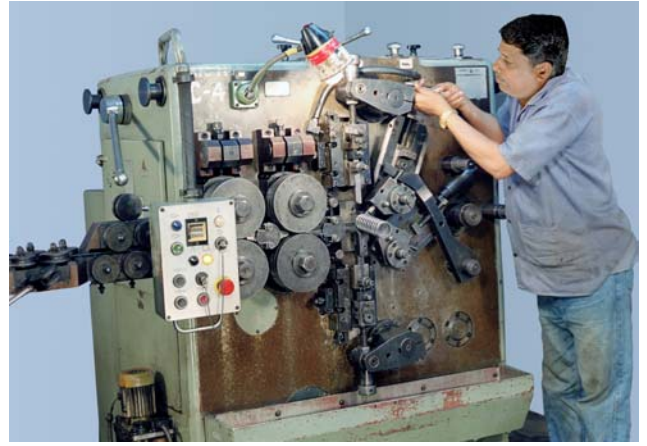
Automatic Coil Machine upto 8.0mm