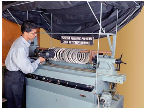
Magnaflux Crack Detector Machine

Scragging machine, Universal Testing Machine (0 to 100 tones)