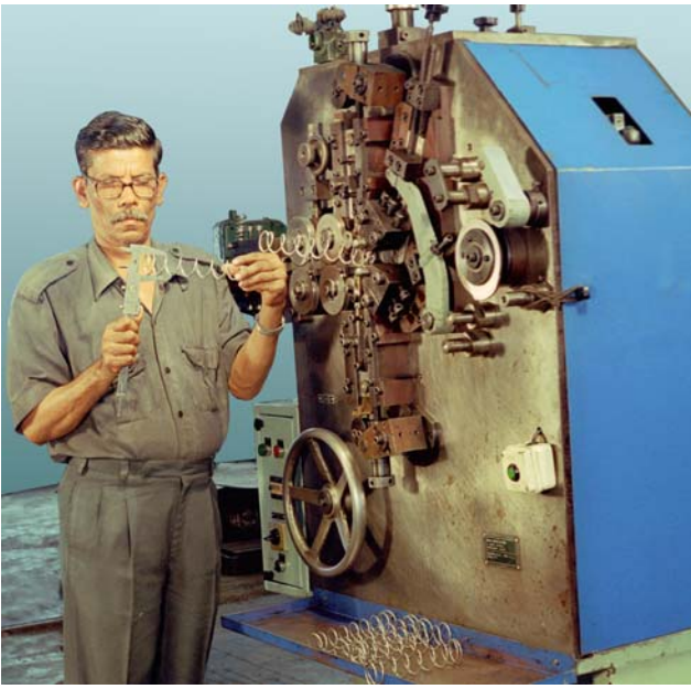
Automatic Coiling machine

Details :- IIS have a very modern in house coiling shop with support of very experienced and professional persons to serve the customer's requirements and their needs with best quality.