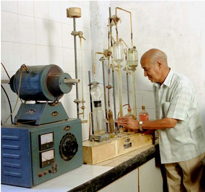
Chemical Testing by Weight Analysis

Details :- IIS have a full fledged Lab. Department equipped with complete material testing facilities (both chemical & physical). Lab has complete metallurgical testing facilities of iron, ferrous and non ferrous alloys and metals with a team of very qualified and professional persons.