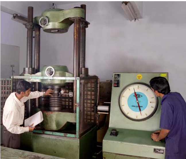
100 ton Universal Testing Machine

We have developed fixtures to ensure the springs are not deformed (squareness & parallelism) during scragging.