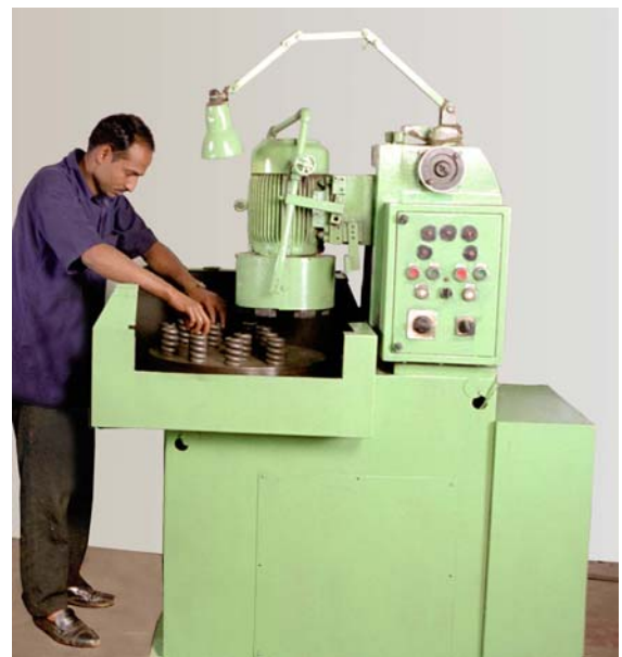
Rotary Surface Grinding

(All measuring equipments and instruments are well calibrated and well maintained)